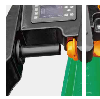
Right and left hand sensing