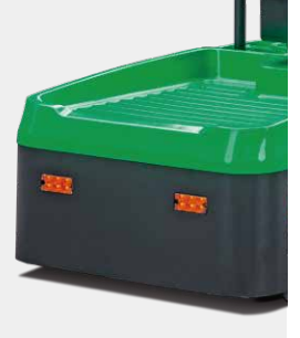
Front and rear flashing lights